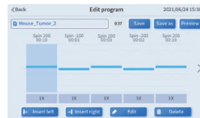
Visualized and editable programs