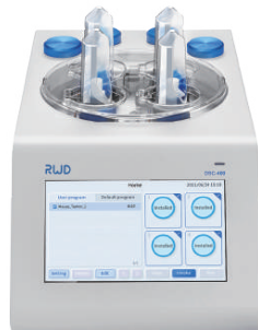
Single Cell Suspension Dissociator