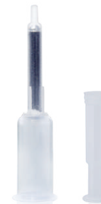
HCSC-25 High-capacity separation column