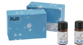
Mouse CD3 + Cell Separation Kit